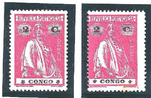
Philatelic star varieties of the .25 Liso (smooth plain) paper in all 16 positions and the 2c in its 2 star position