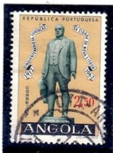
1962 — 50.º Aniv. da Fundação da Cidade de Nova Lisboa. Dent. 14