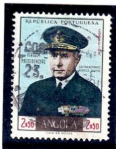
1963 — Viagem Presidencial. Dent. 13 1/2