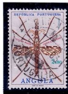
1962 — Erradicação do Paludismo. Dent. 13 1/2