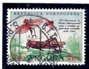
1963 — Combate ao Gafanhoto Vermelho. Dent. 14