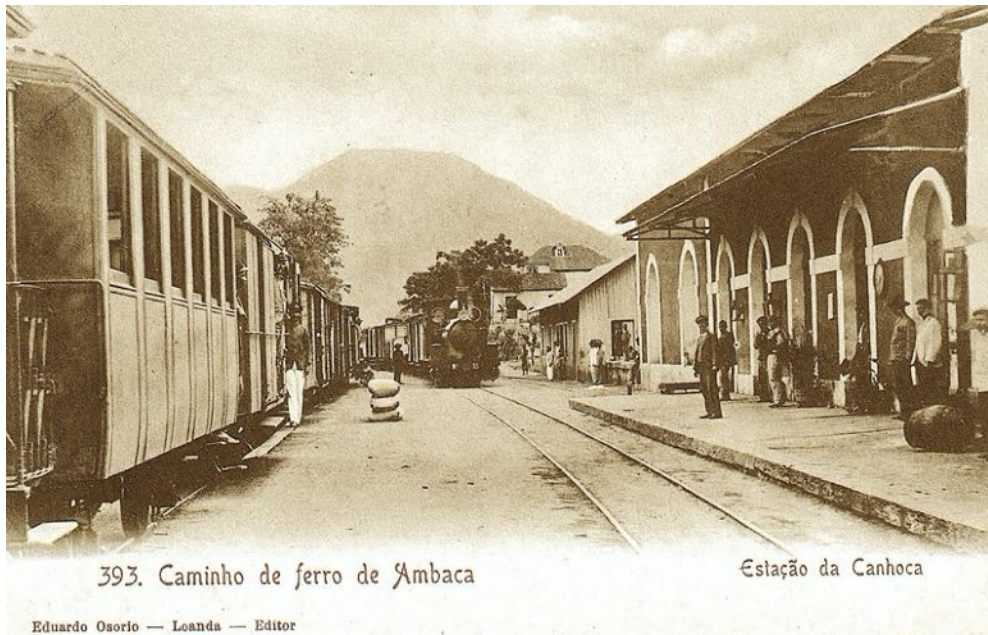
393. Caminho de ferro de Ambaca